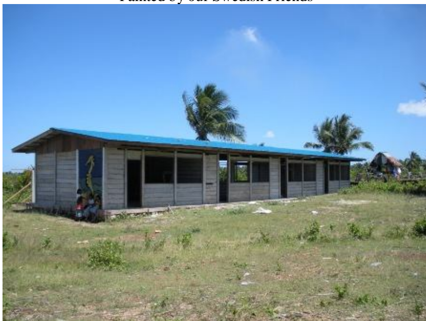
Seen from a distance.March 2009 – Centre is practically completed.