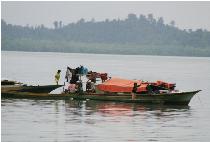
Most of the children are growing up in these houses or in periods on small family boats in the open sea. Most have no chance of education during their entire childhood.