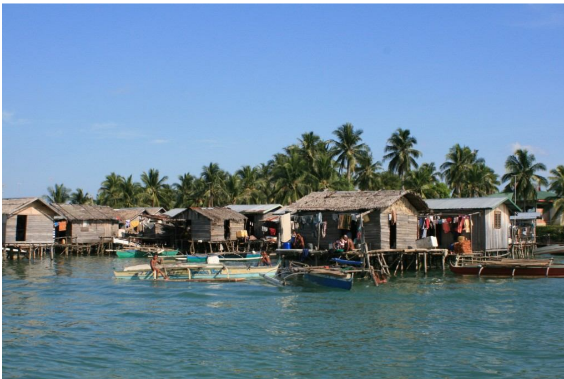
This settlement is located only 200 meters from the Learning Centre. These are the homes of the children.