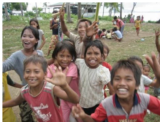
Children eagerly awaiting the schools completion on Bumbum Island.