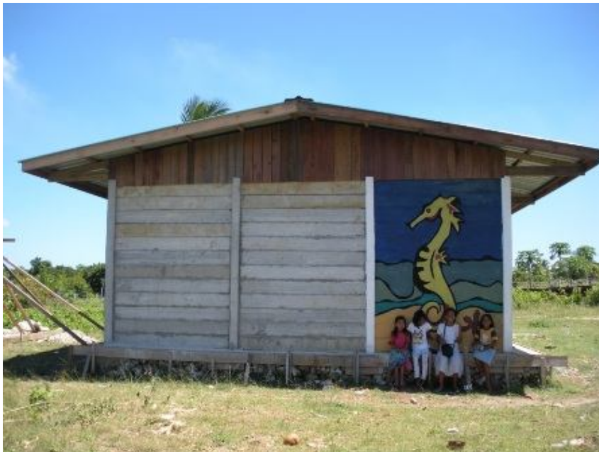
A seahorse as symbol Fitting for the centre. Painted by our Swedish Friends