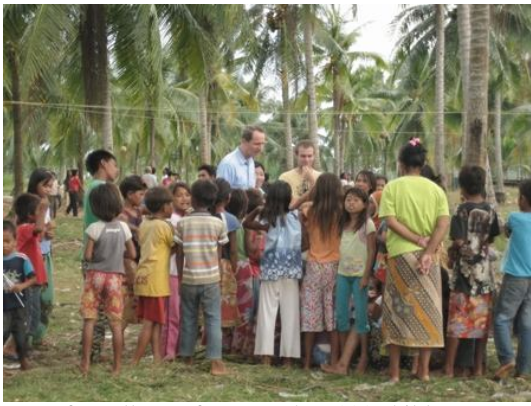
Day of enrollment for more than 200 children.