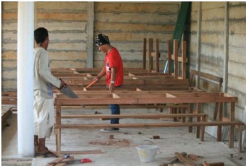
Construction of tables and benches