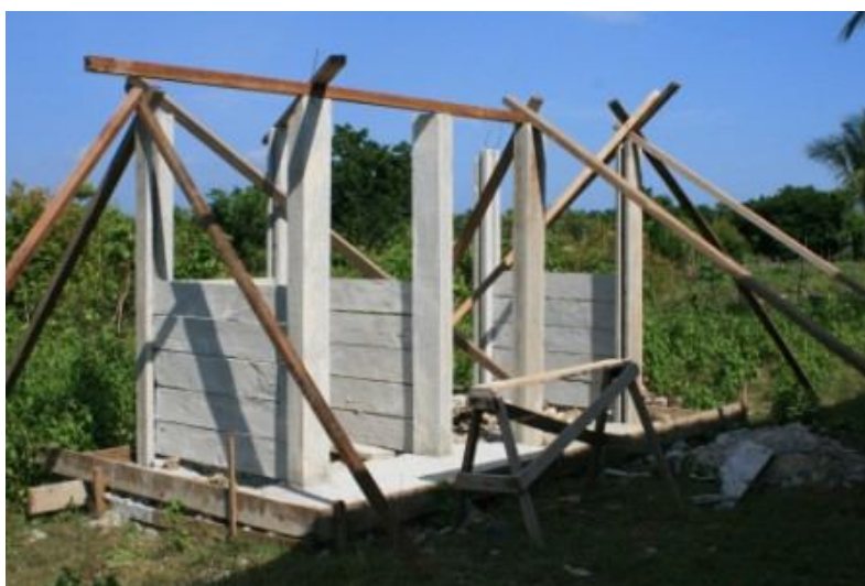
Toilet building is using the same concept and colours of course traditional Swedish red and white, which is being painted right now.