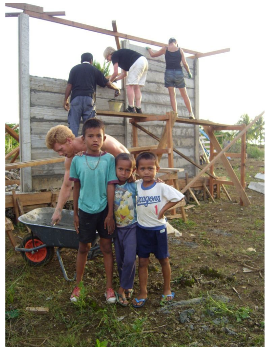
. Start of construction in November 2008