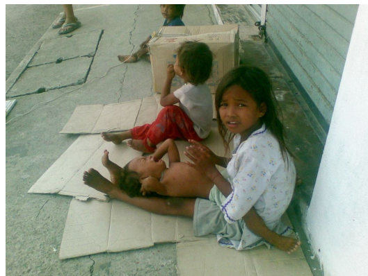
Without access to school many live a miserable life on the streets begging and often victims of abuse.